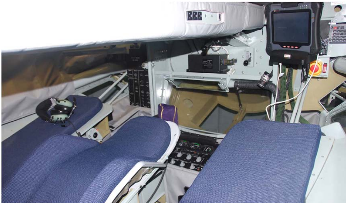
Boom Pod with portable IOS in Instructor position