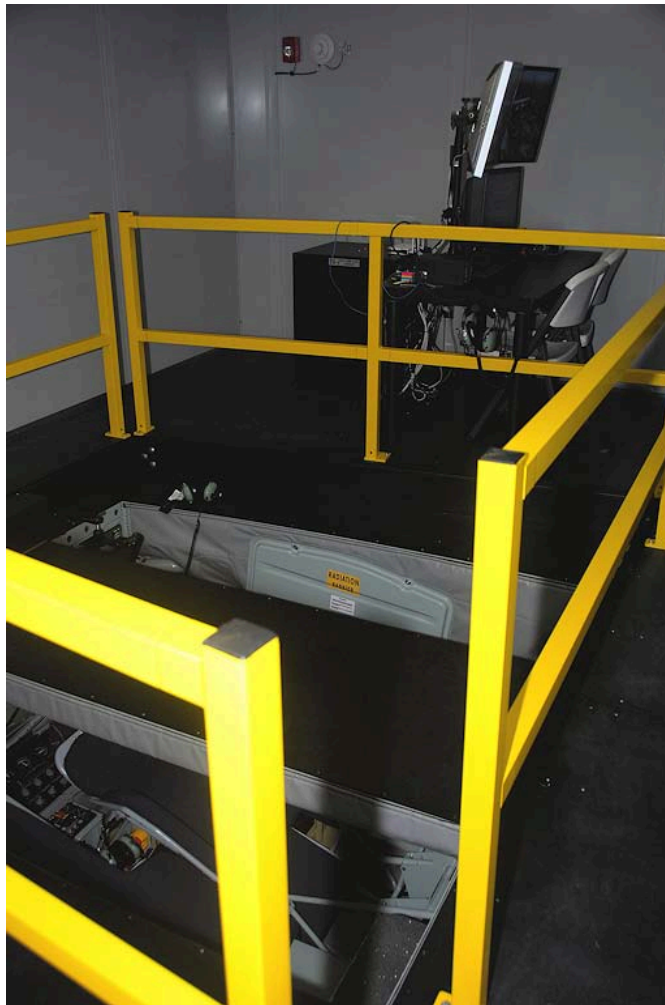
Interior top view of Boom Pod with Instructor Operator Station (IOS)