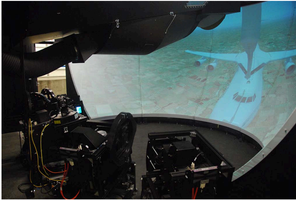
View of 200 degree screen