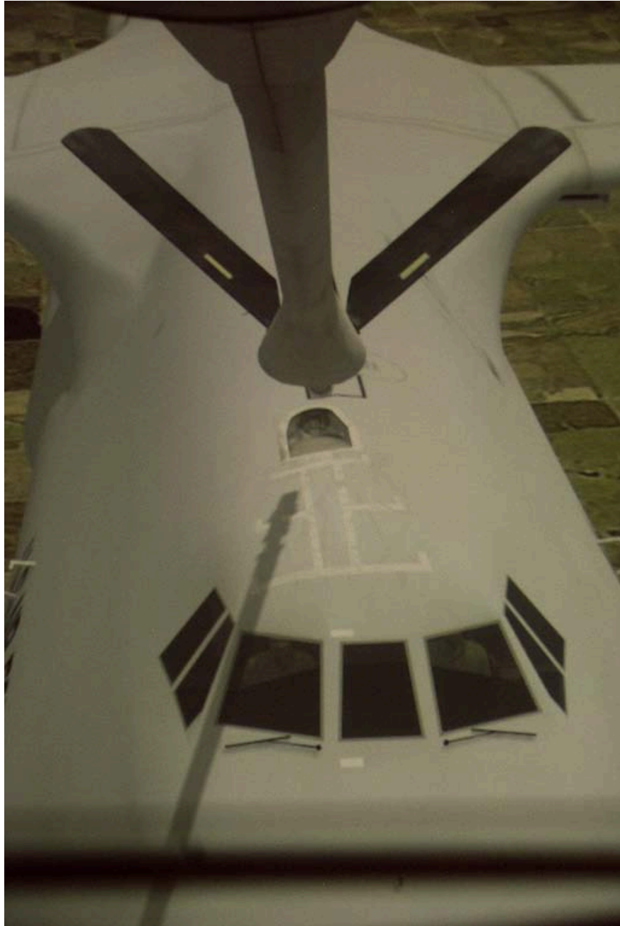
BOWST image of a C-5 just prior to contact